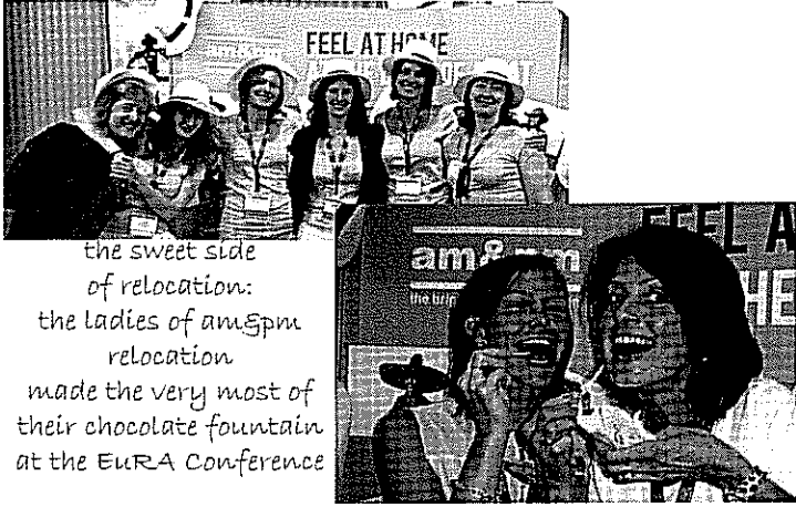
the sweet side of relocation: the ladies of am&pm relocation made the very most of their chocolate fountain at the EuRA Conference